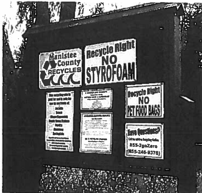
Message Center at Brown Township Recycling Site