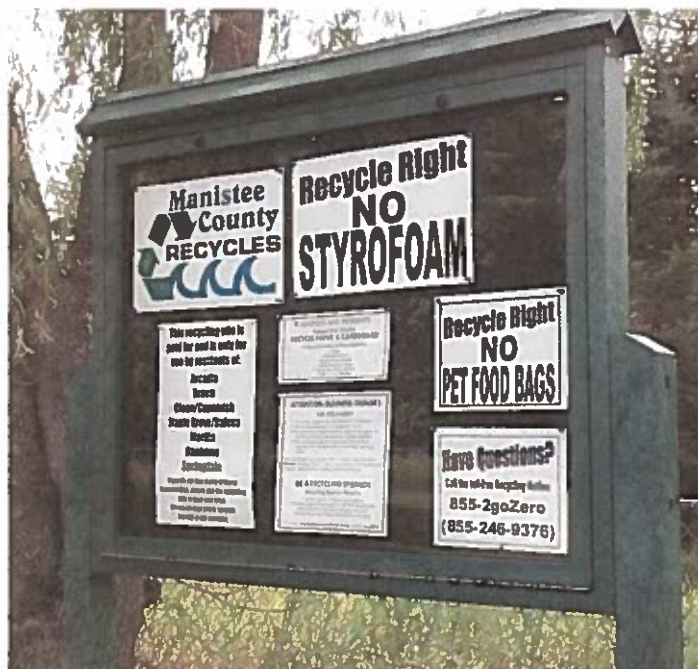
Message Center at Brown Township Recycling Site