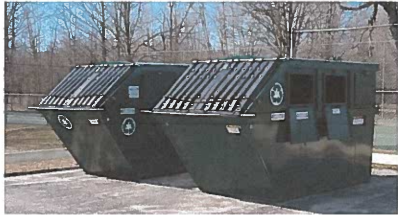
PA69 Recycling Bins

There are 7 recycling drop-off locations that are accessible year-round to residents of participating PA69 Townships. The sites are accessible during daylight hours, 7 days per week. Use of these sites is limited to PA69 Township residents only since they are funding the recycling program. Use of the PA69 recycling drop-off sites by